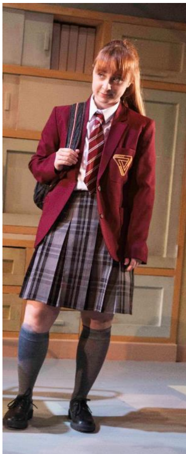
This actor plays Becca.