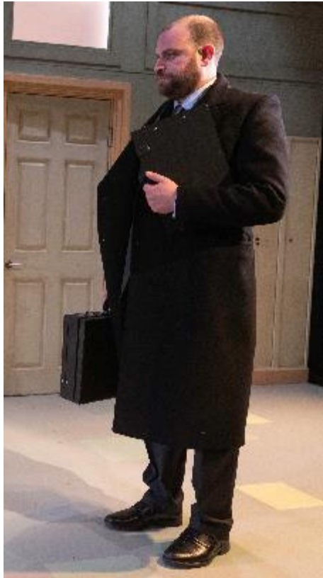
This actor plays The Bureaucrat.